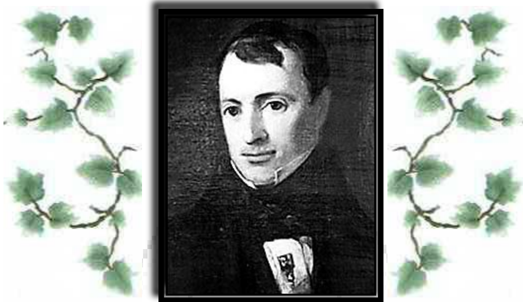
Brother John Bannister Gibson 1780-1853