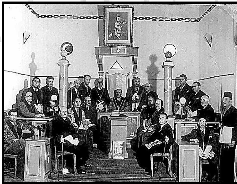
A Cairo Lodge in the 1940's under a picture of King Farouk

Freemasonry was under great pressure to close in Egypt by 1954 under the Nationalist Movement and Gamal Abdel Nasser became Prime Minister and the British gave up control of the Suez Canal. It was officially outlawed in 1964. Masonry still gets trotted out as a boogymen periodically in Egypt, as in other Muslim countries. Rotary Clubs frequently come under fire as being nothing more than Masonry in sheep's clothing. (to be continued...)